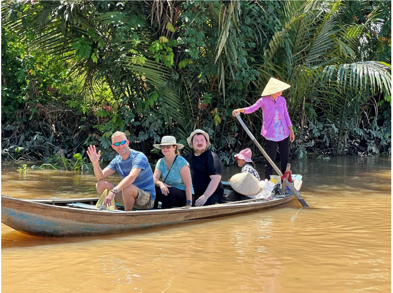
Cruising on Tien (Mekong)